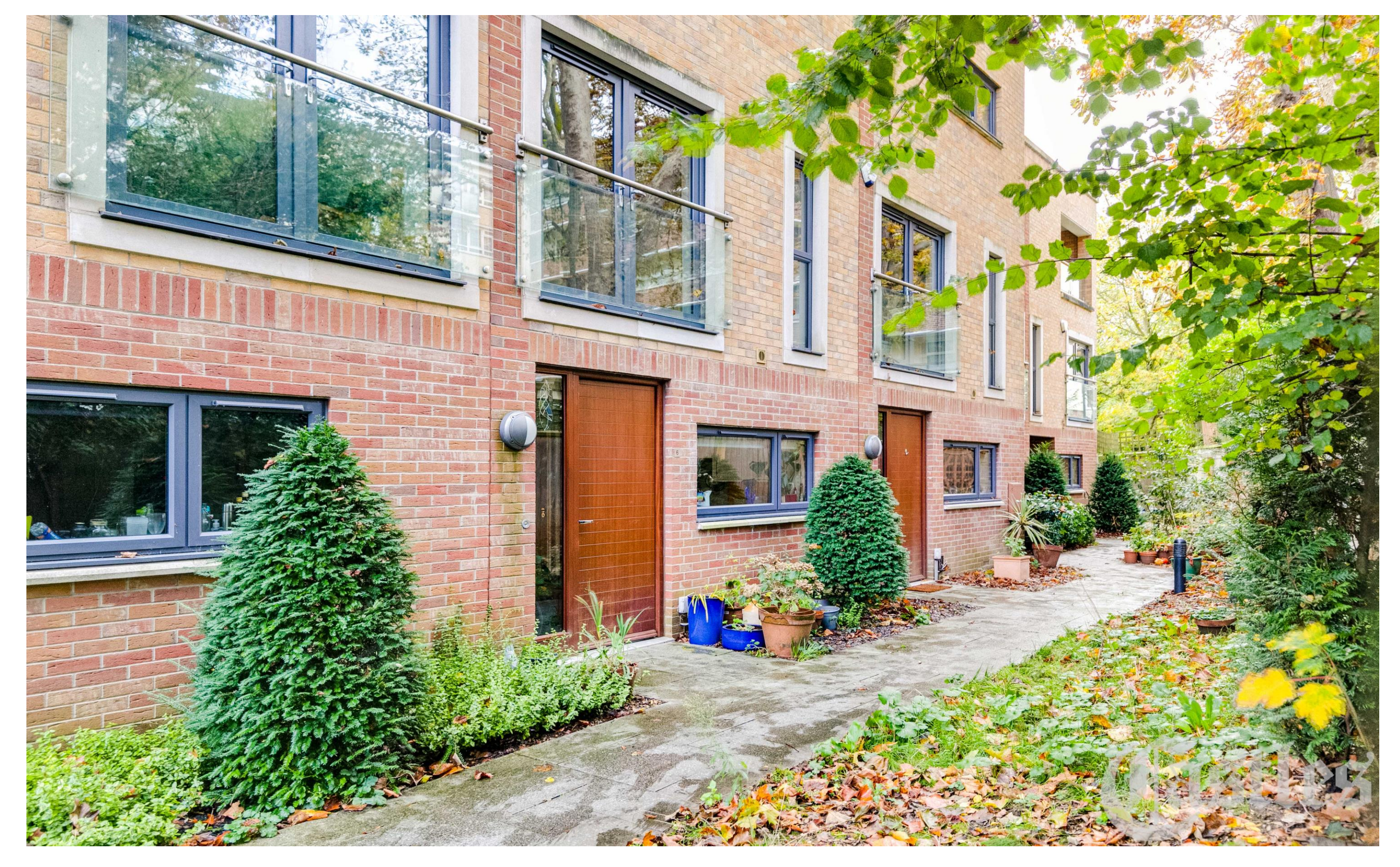
Bridgemount Mews, Mount Pleasant Villas, N4