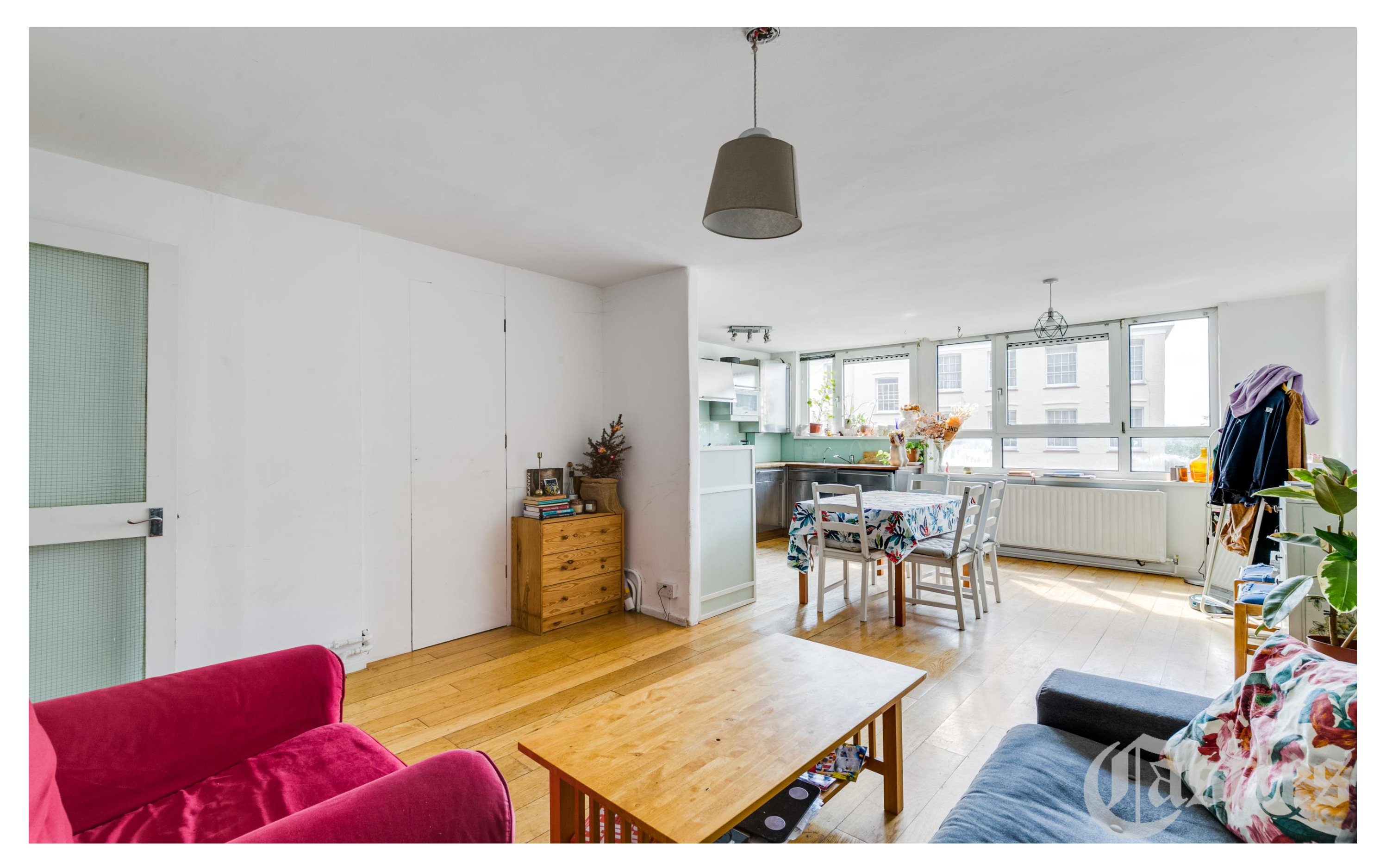
Warltersville Road, N19