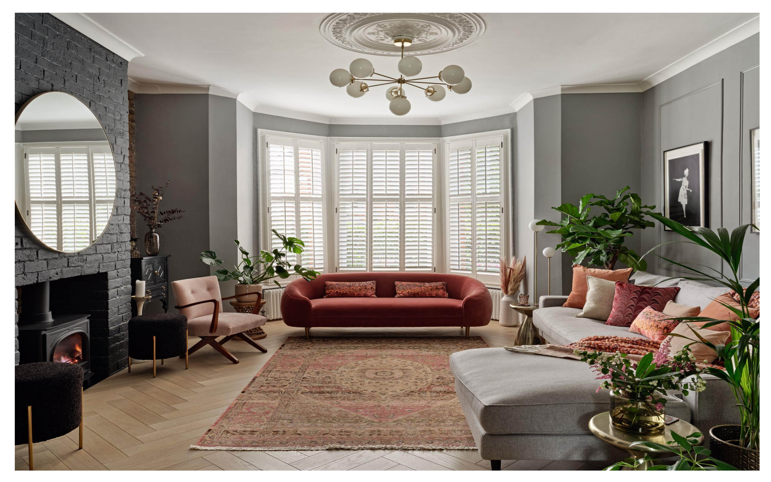
Ridge Road, N8