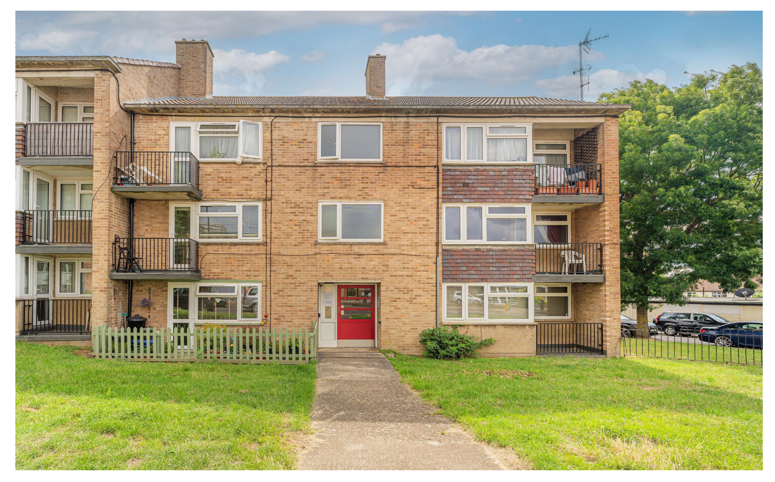
Brigadier Hill, EN2 0NH