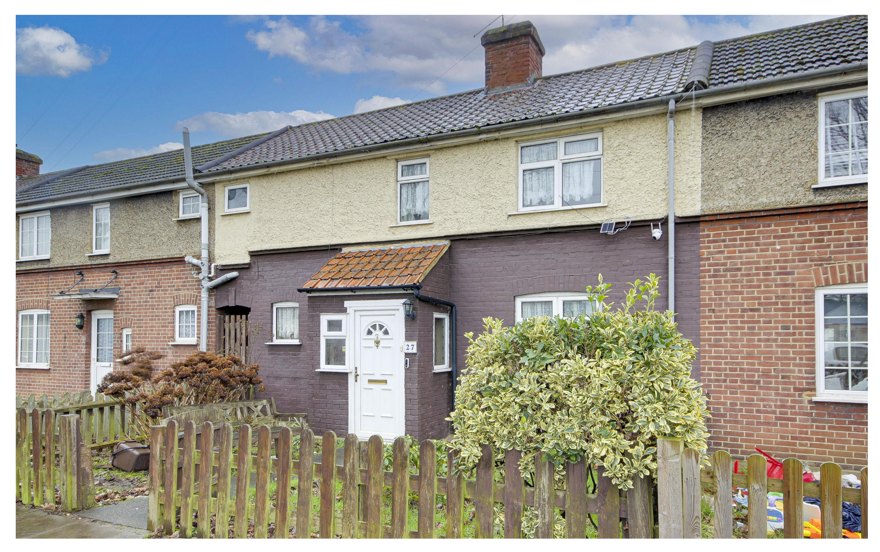
The Link, EN3 5HU