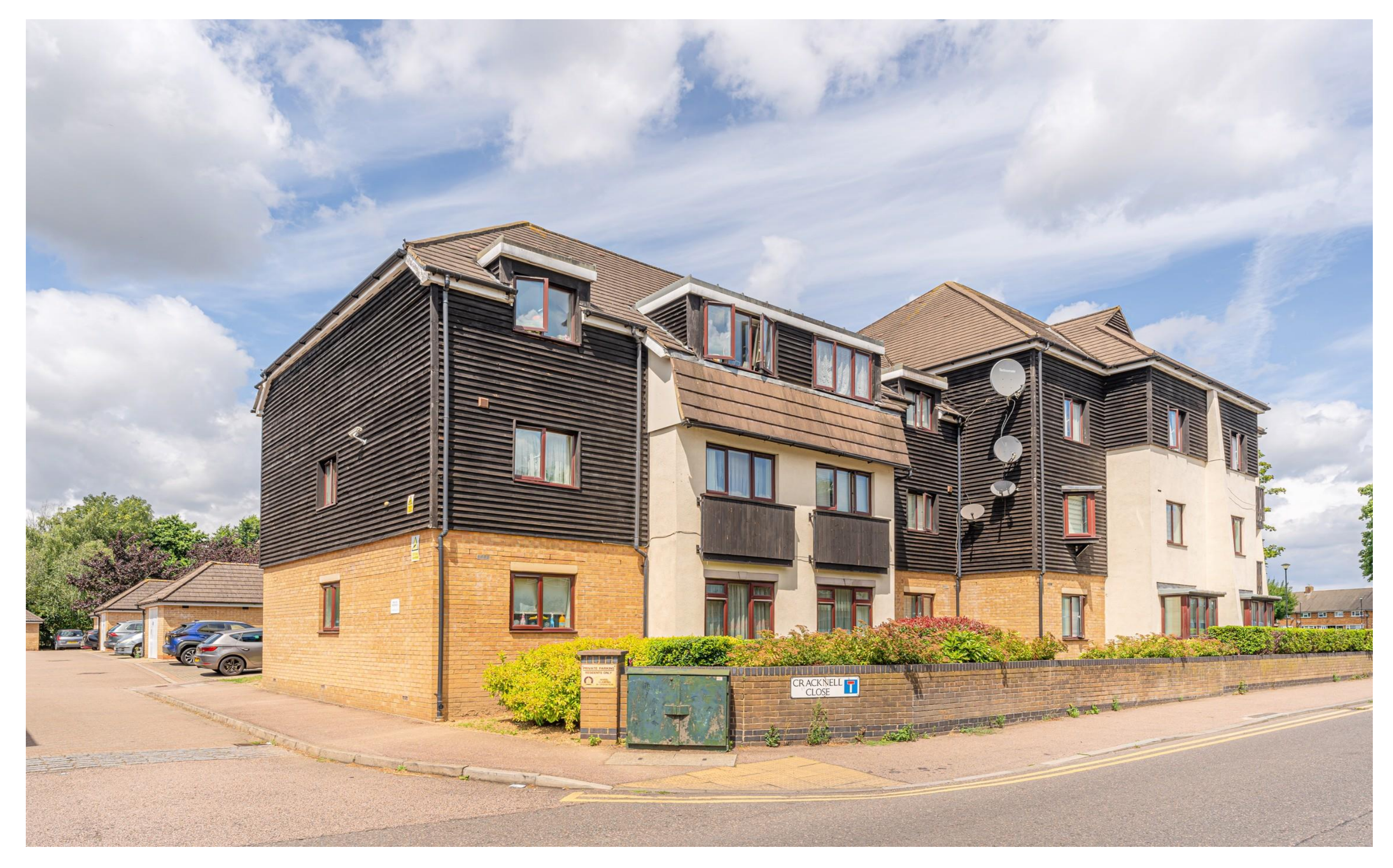
Cracknell Close, EN1 4NL