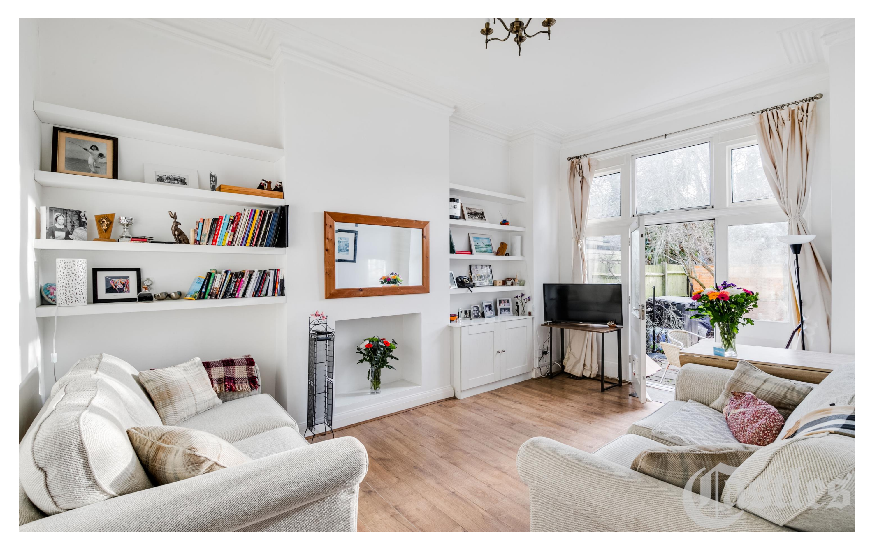
Princes Avenue, N10