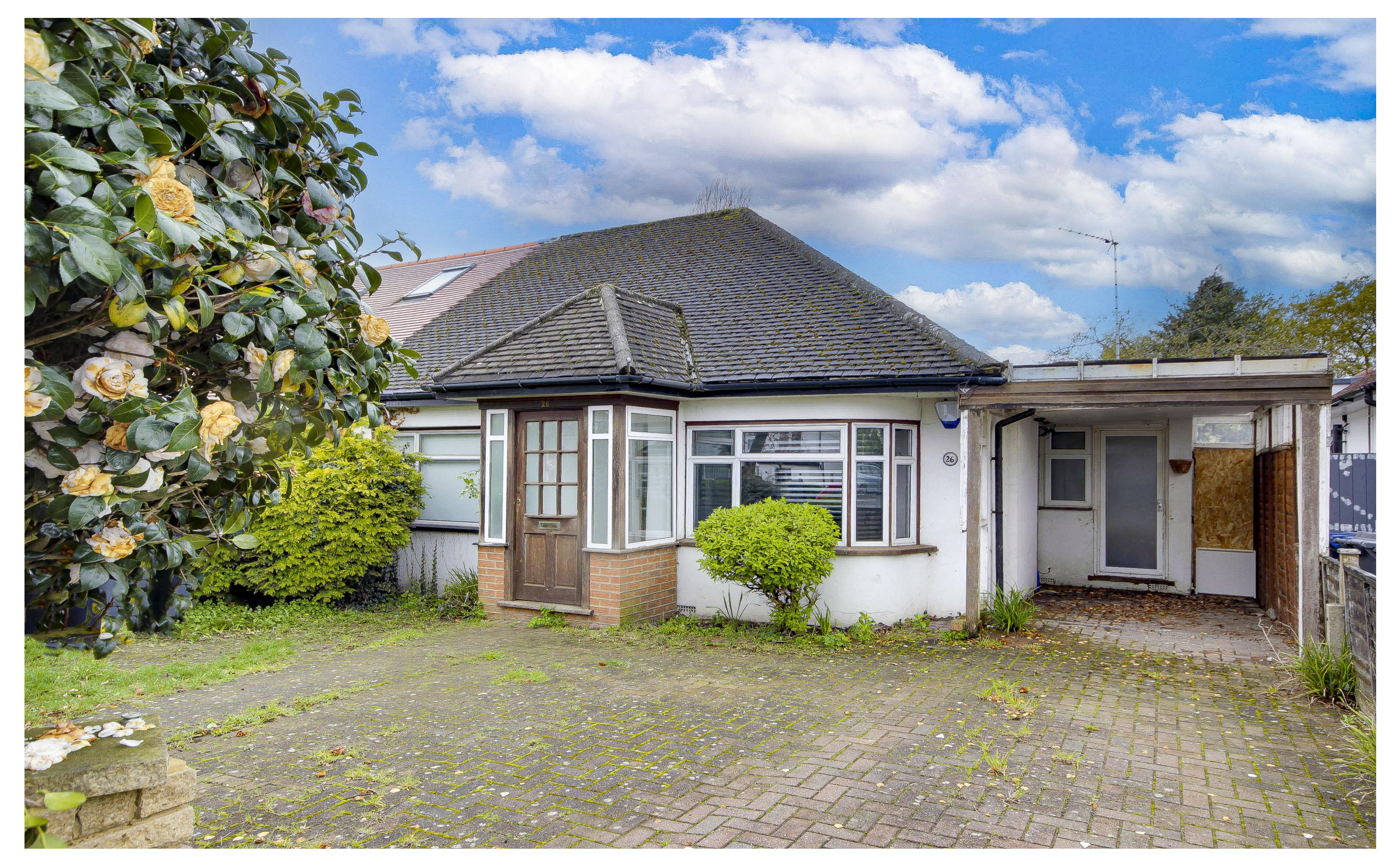
Bittacy Rise, NW7 2HG