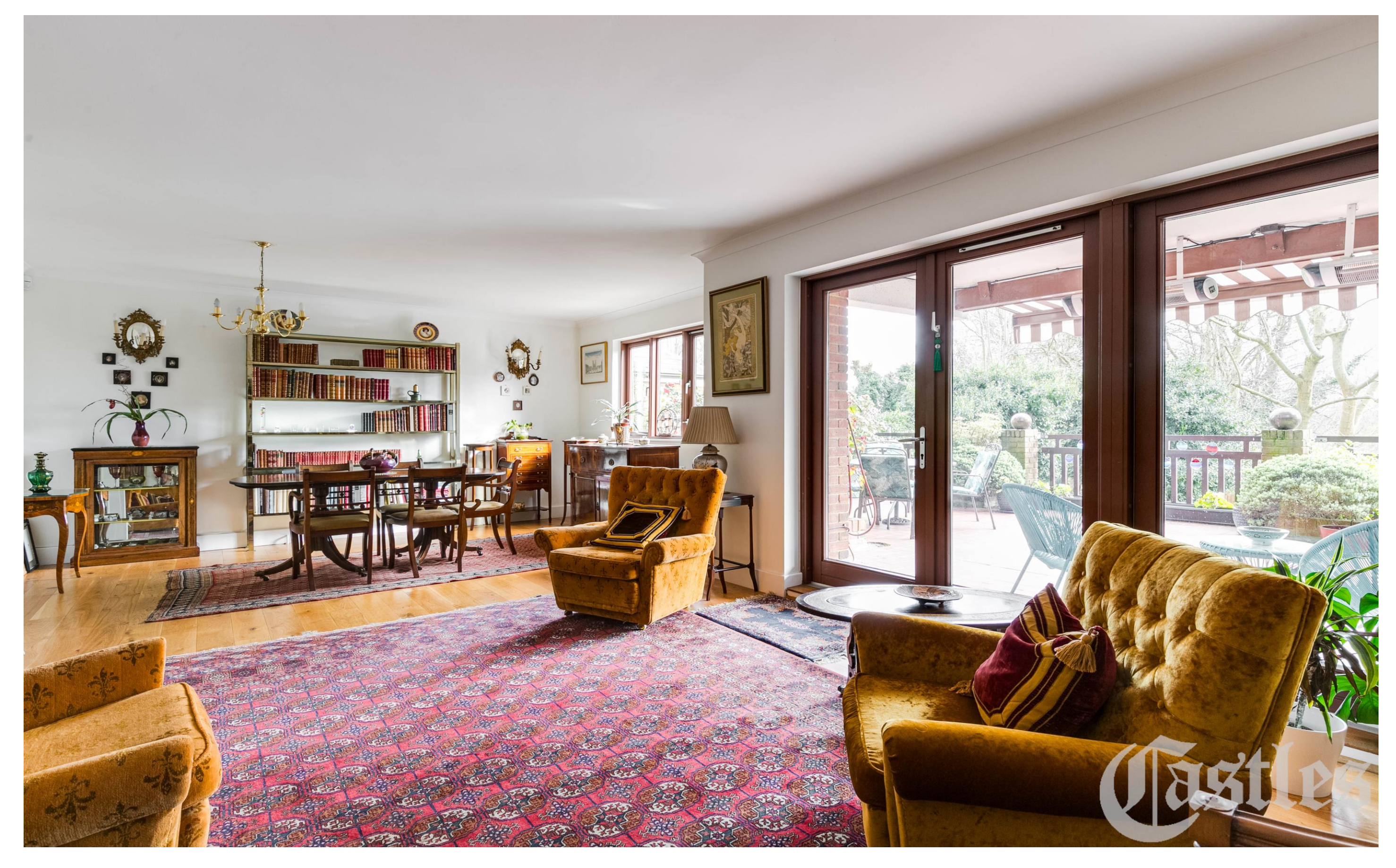
Stanhope House, Shepherds Hill, N6