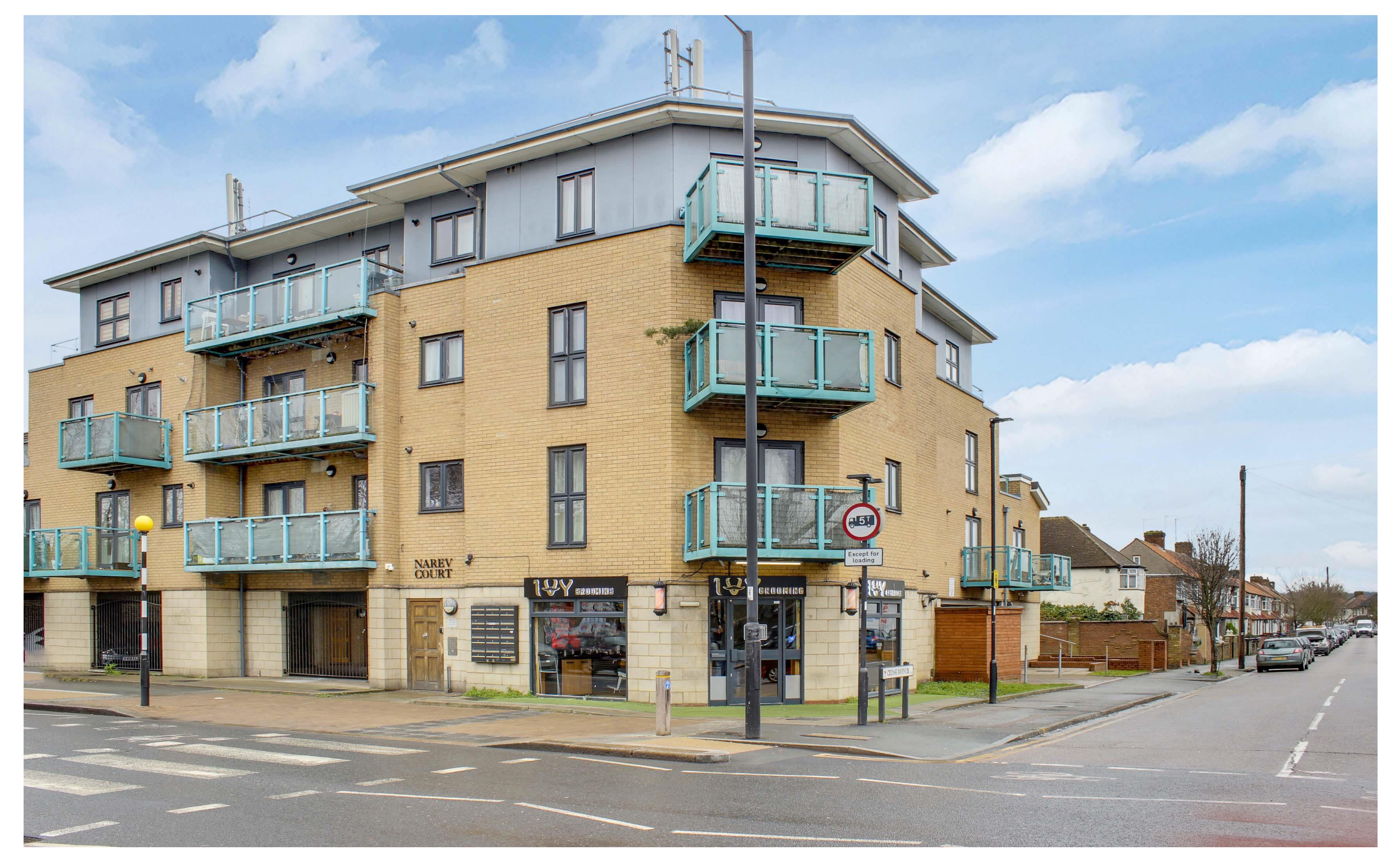
Narev Court, Cedar Avenue, EN3 7JB

£235,000 Full Ownership Leasehold Also available £58,750 for 25% Shared Ownership