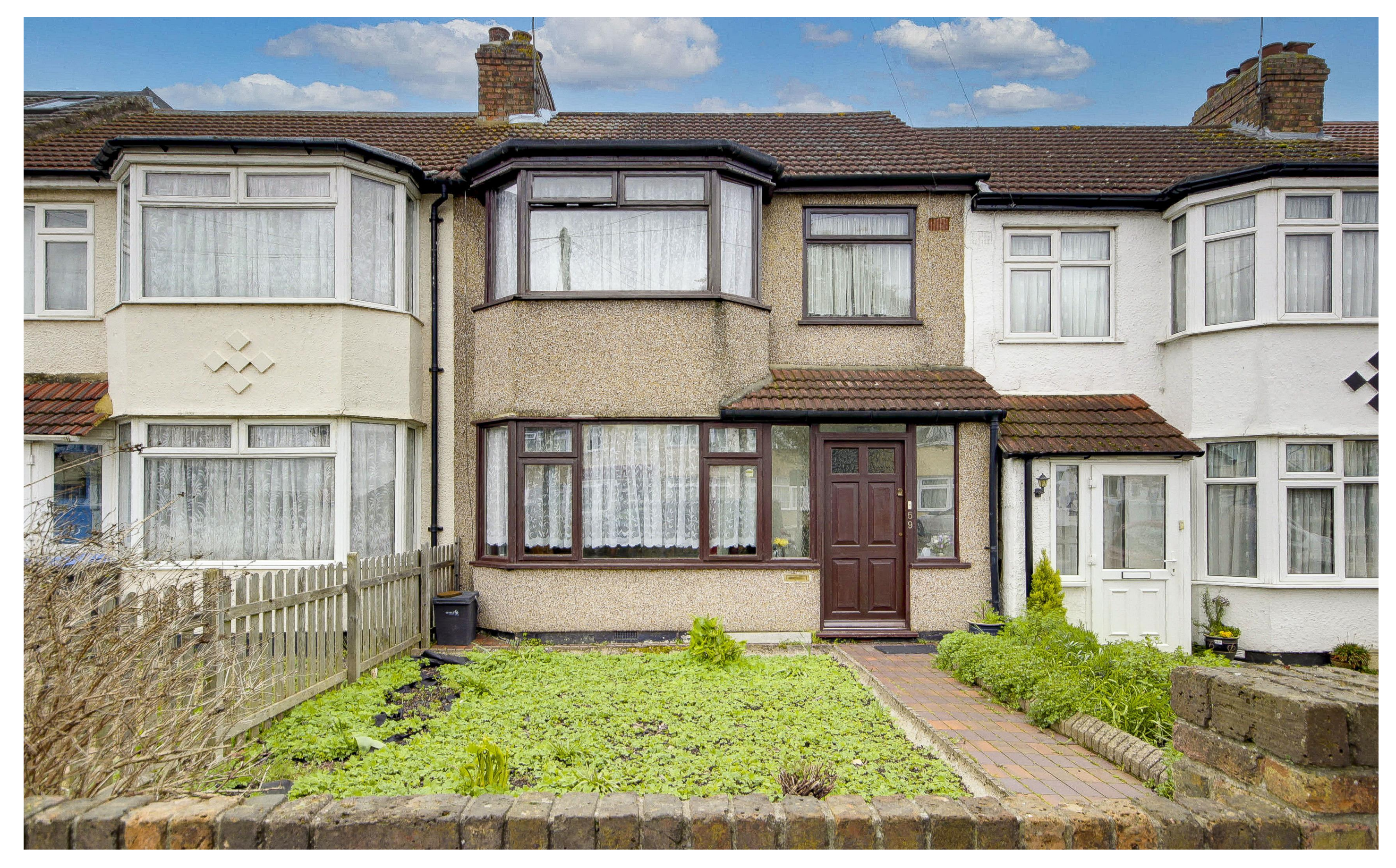
Broadlands Avenue, EN3 5AQ