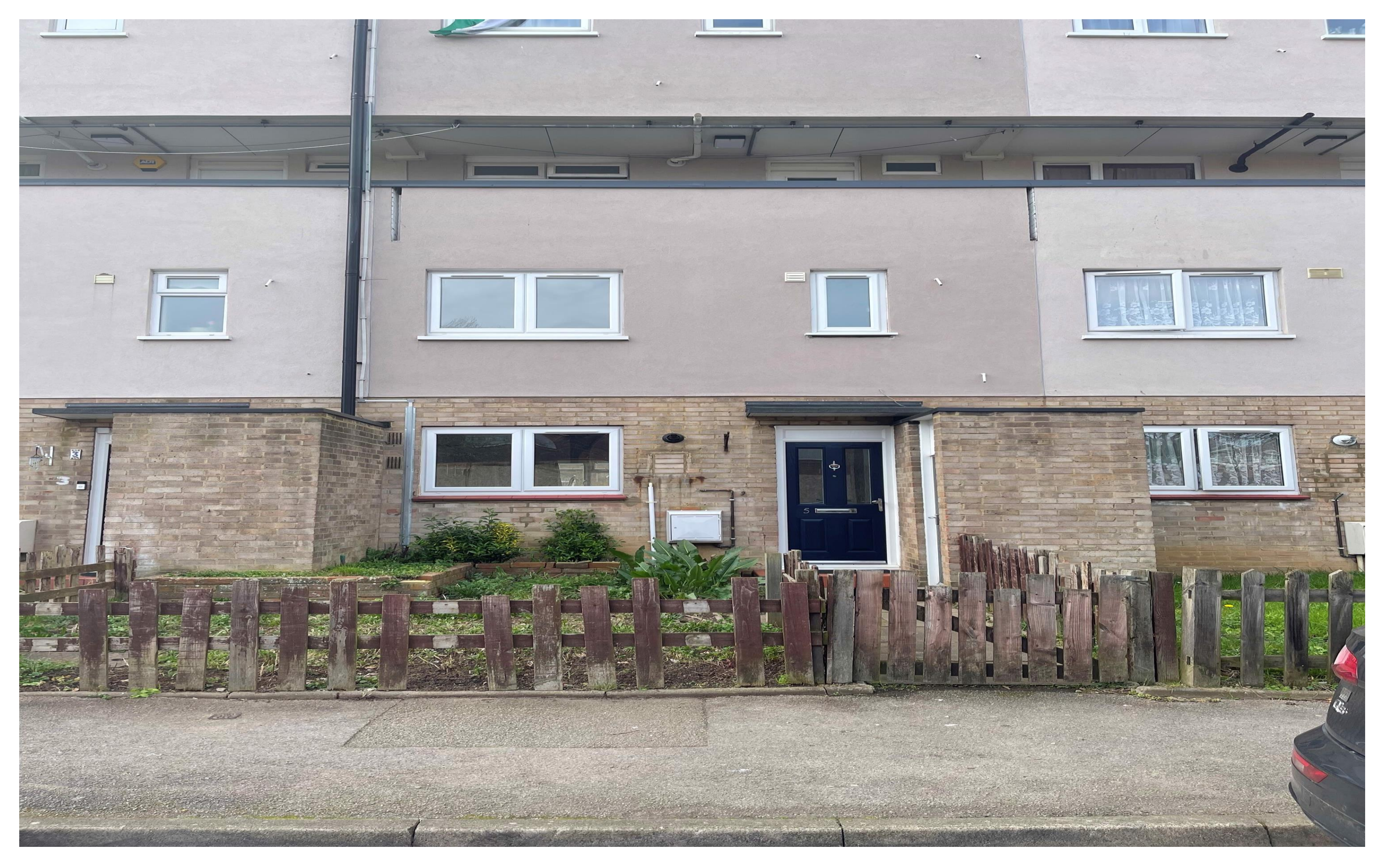
Moorfield Road, EN3 5XN