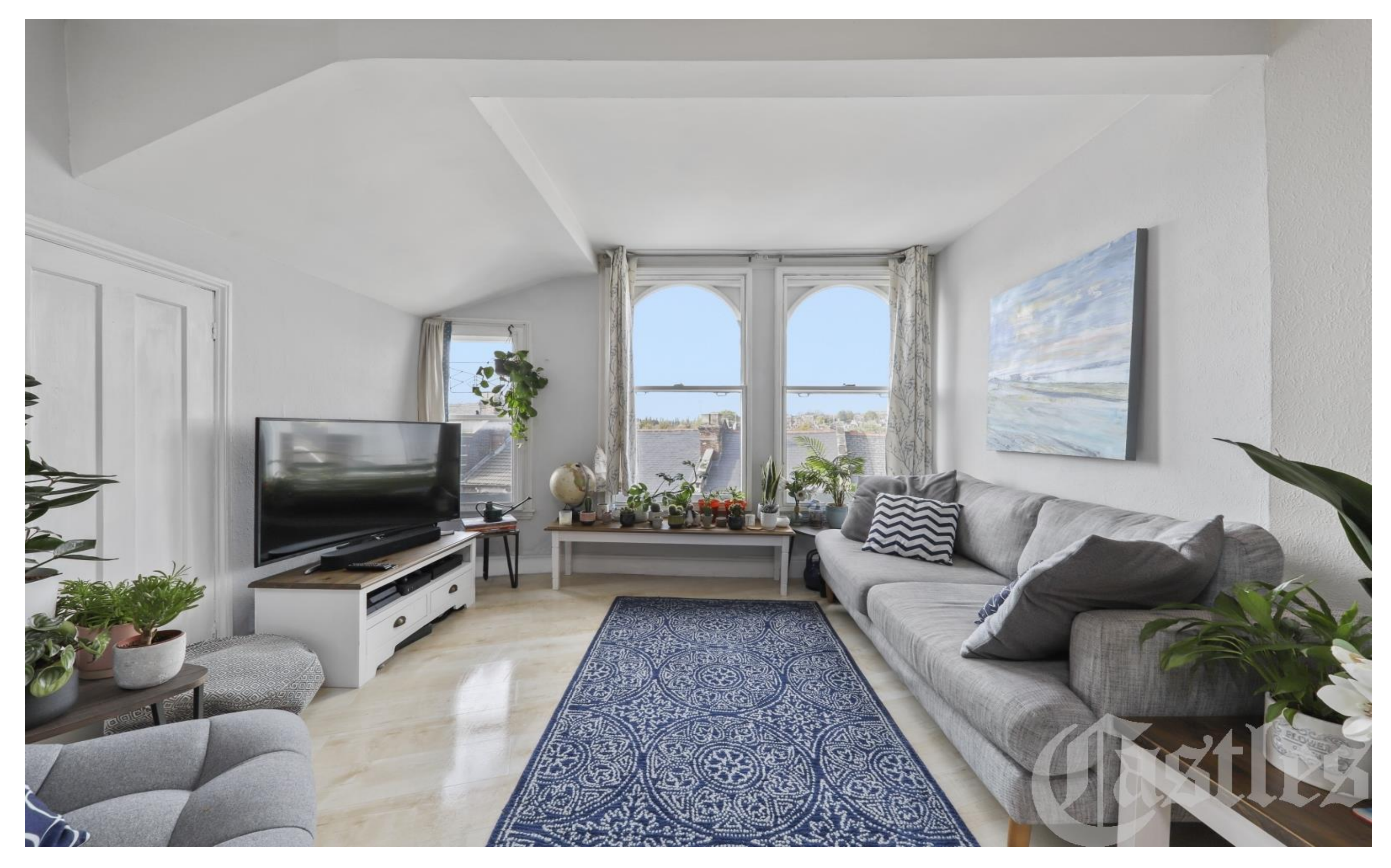
Topsfield Parade, N8