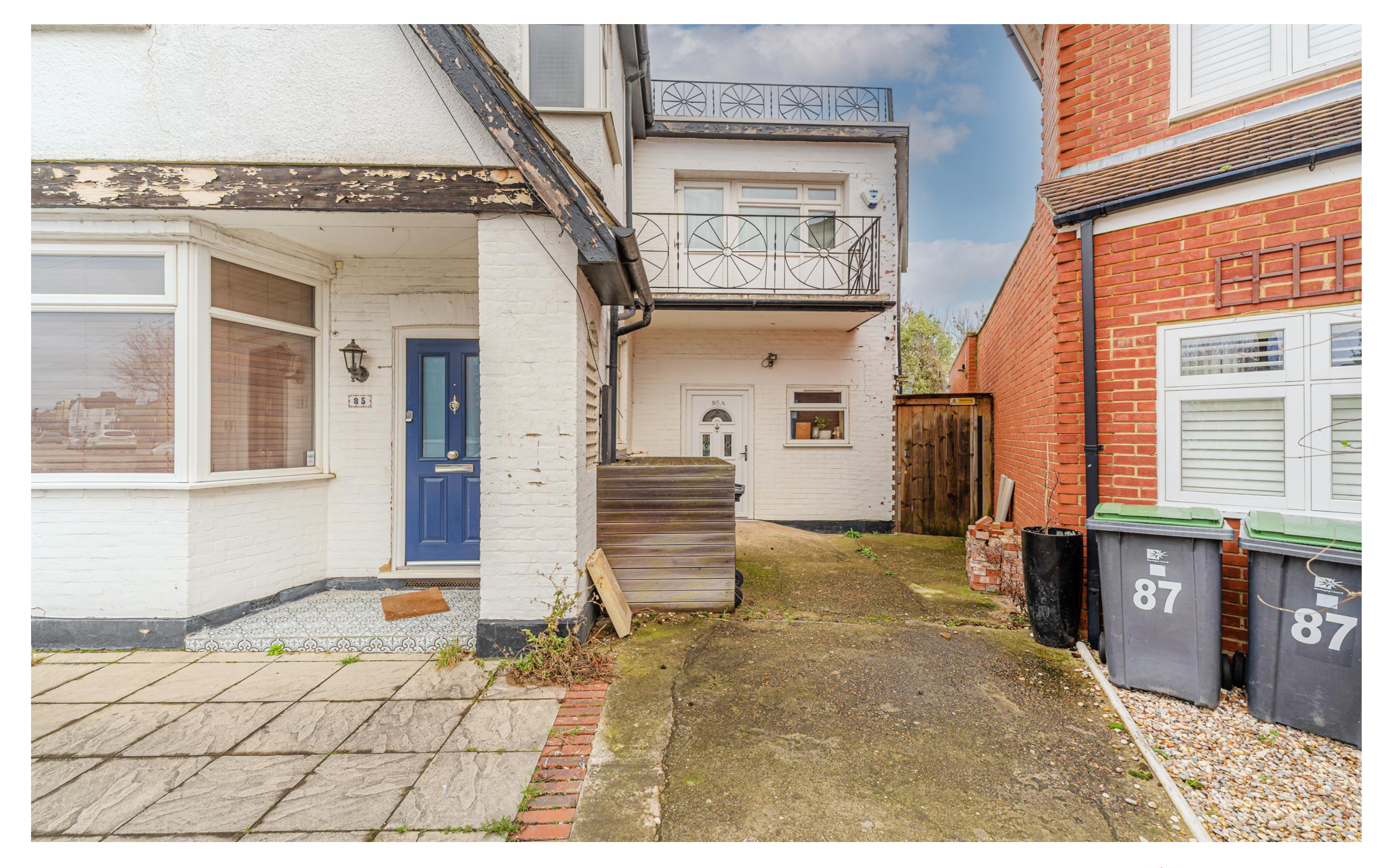
Stirling Road, N22