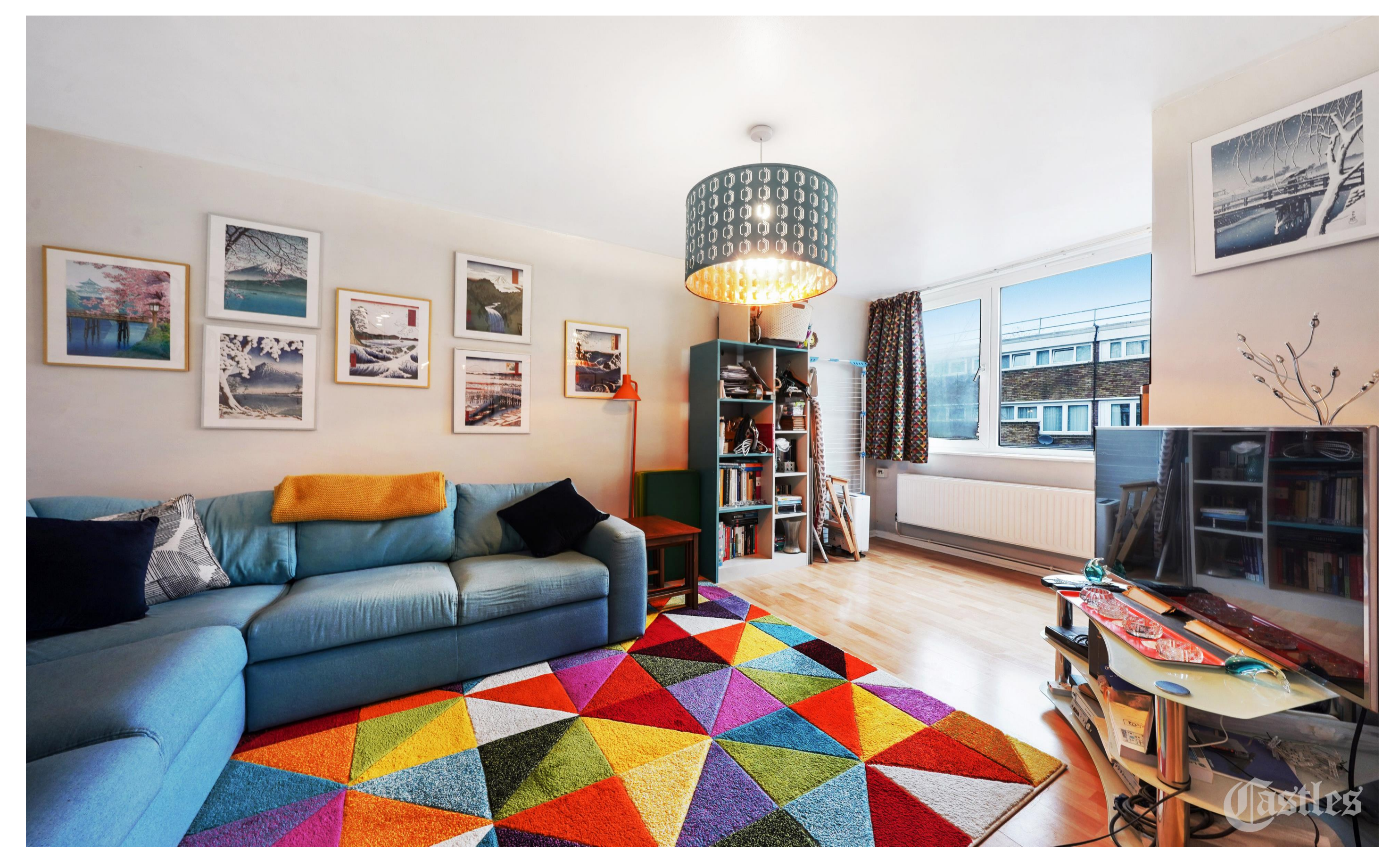
Lambert House, New Orleans Walk, N19