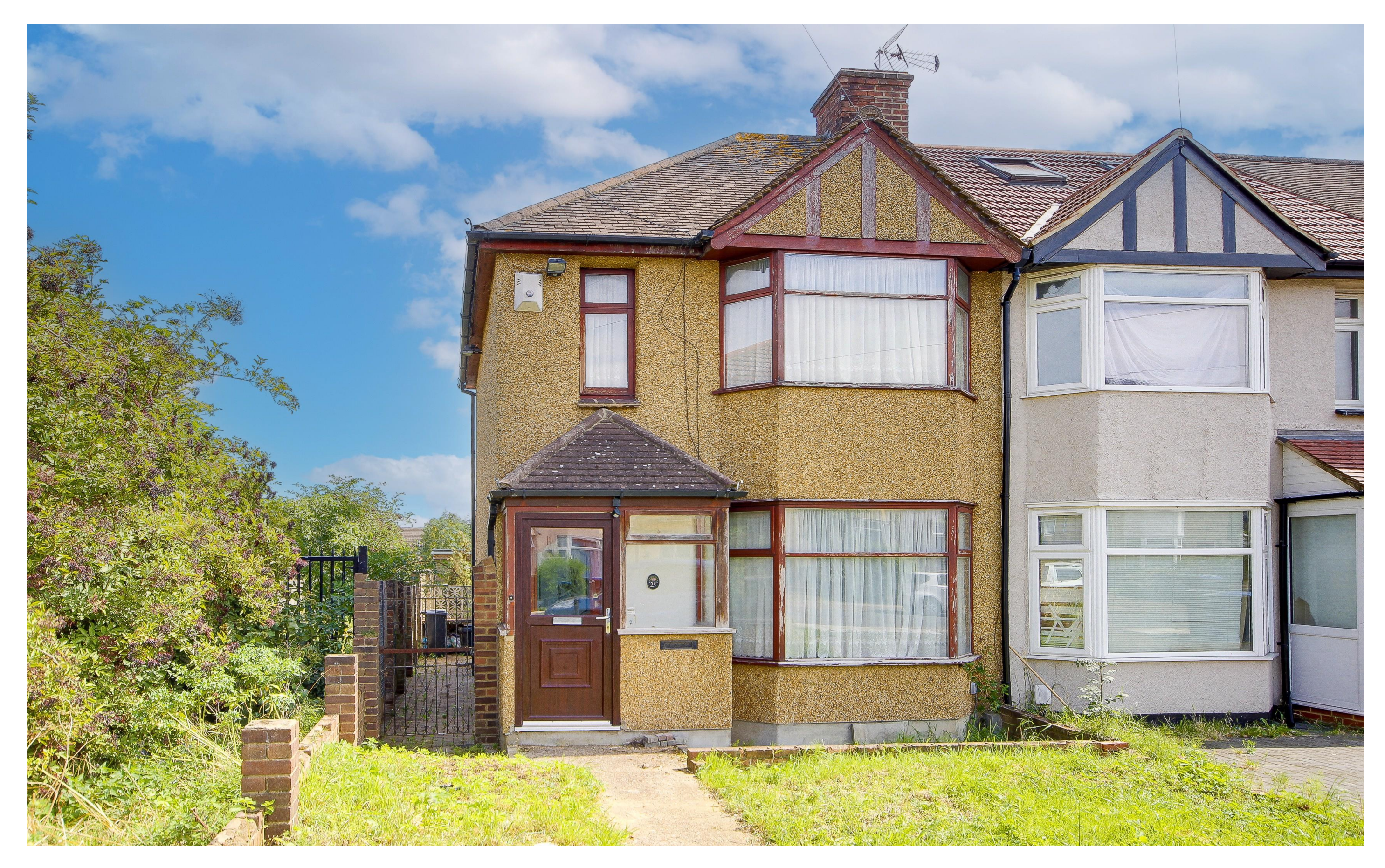
Greenwood Avenue, EN3 5DN