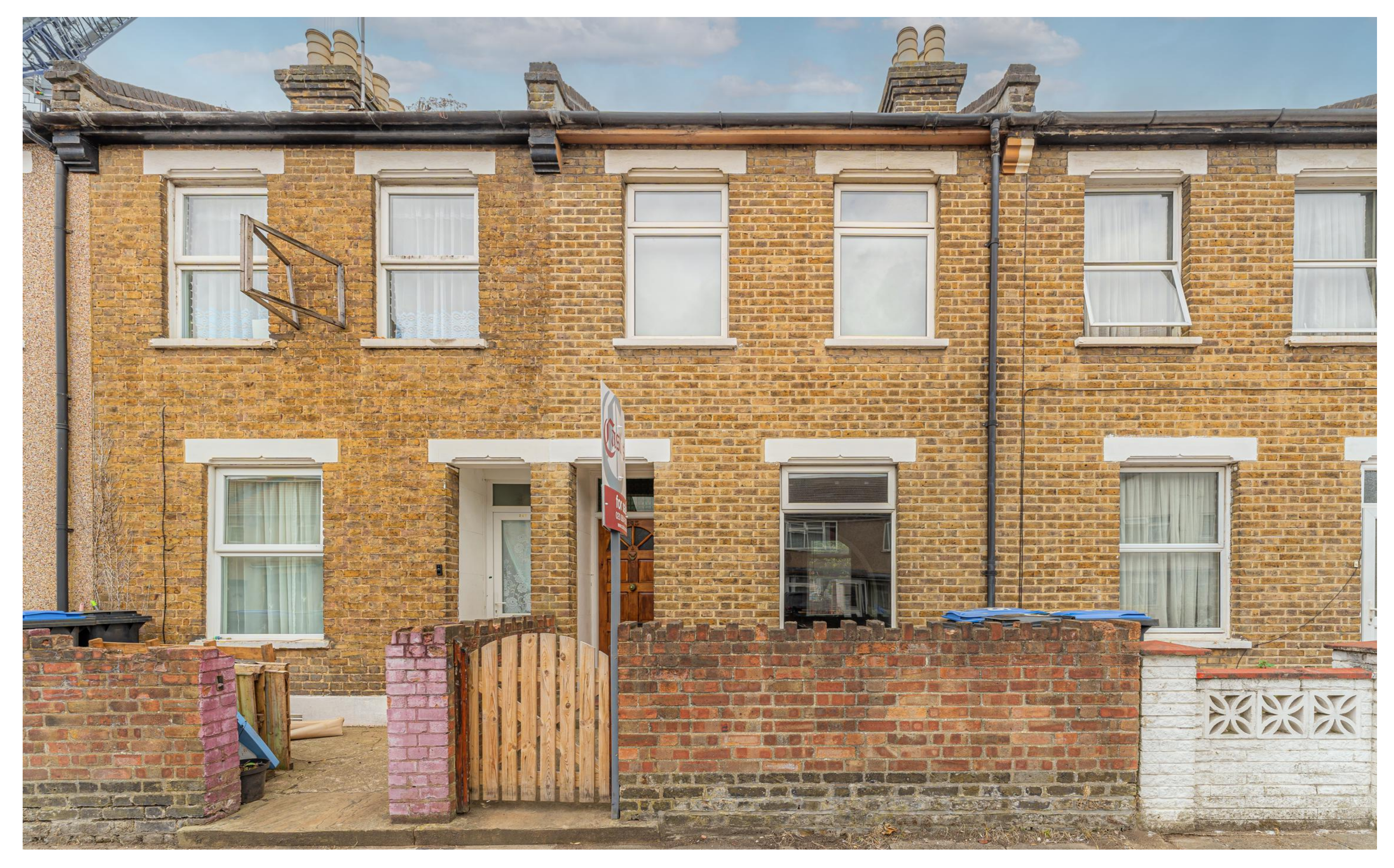
Scotland Green Road North, EN3 7AU