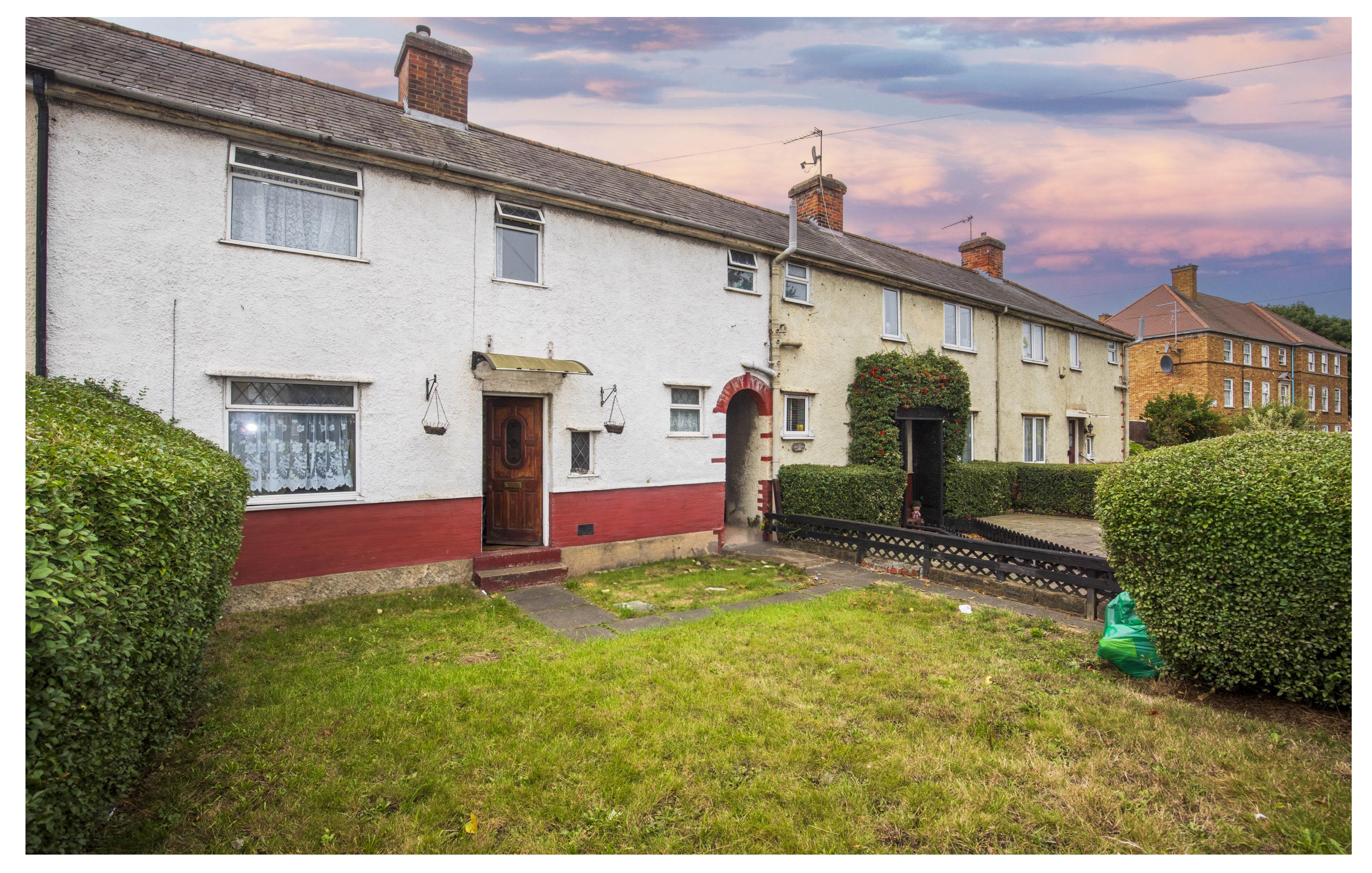
Carterhatch Lane, EN1 4LB