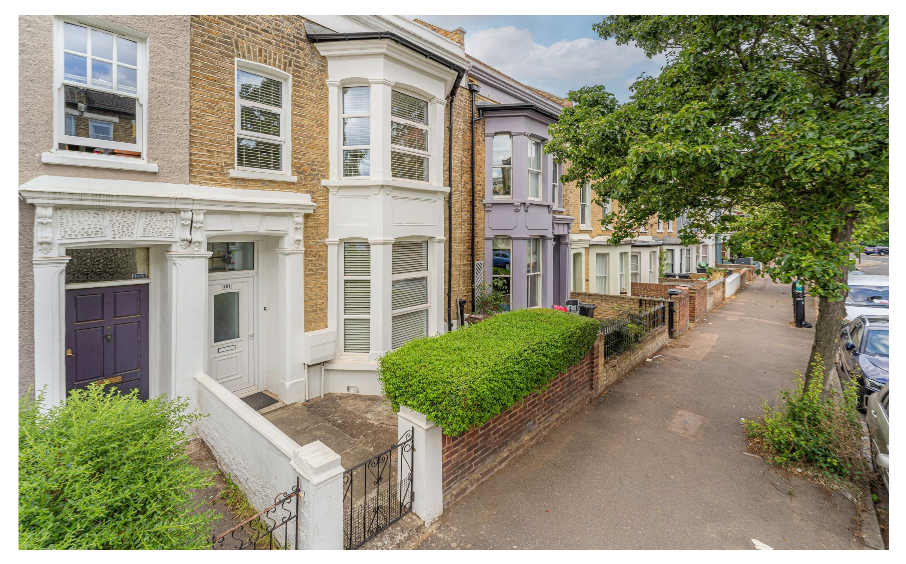
Powerscroft Road, E5 0PR