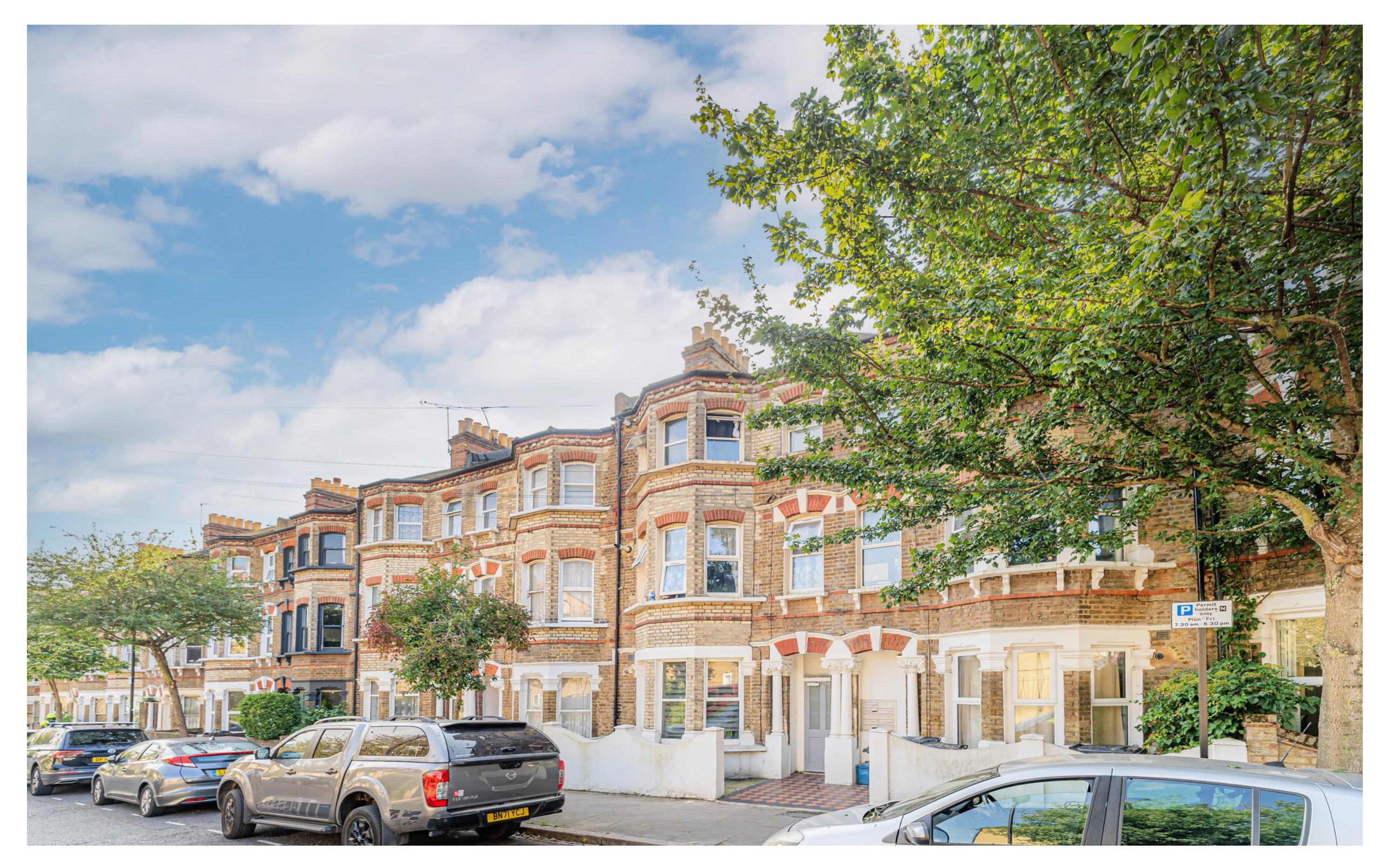
Millfields Road, E5 0AD